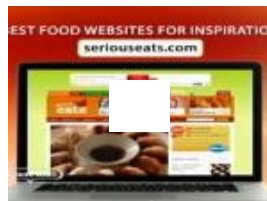
Web for Foodies