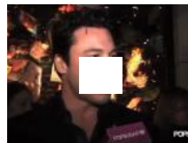
Food Network Chefs on Favorite Holiday Recipes and Cooking Tips